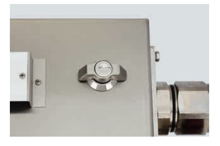
Three types of cam locks: double bit, slotted or lockable