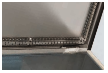
EMC contact spring prevents effects of electromagnetism