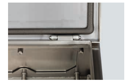
Screwed or hinged cover