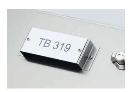
TAG label holder