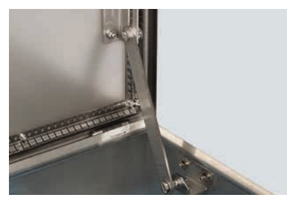
Lockable lid retainer