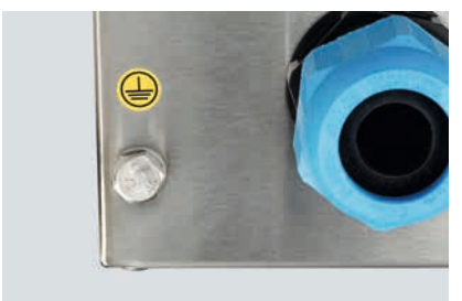
External PE connection M8