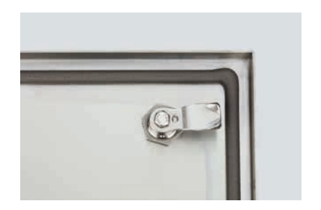
Durable, foamed silicone seal