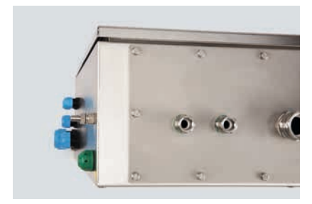
Easily removable external gland plate